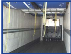
Split Bulkheads swing up & down, slide forward & back

SPEC SUMMARY: 2002-04 Great Dane/Utility Multi Temp Reefers (Most '03 GD-TK), 53'x13'6"x102, Spring Ride, Roll Door, Alum Flat Floor & Roof, TK SB30 refrigeration units, 10,000-14,000 hours, Flip up bulkheads separate into 3 sections, E-Track, 36" Kingpin, Sliding Axle, White, Aluminum Roof, Sheet & Post, Tires 295/75R 22.5.