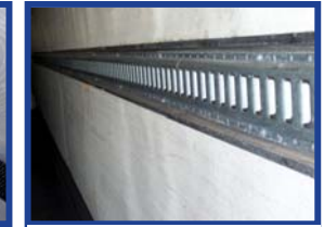
Secure Cargo with e-track

AVAILABLE NOW @ AKRON, BALTIMORE, CARLISLE, COLUMBUS, GREENSBORO, INDIANAPOLIS, MOUNTVILLE, RALEIGH, & RICHMOND