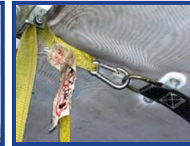
Quick-Release Bulkhead Clips