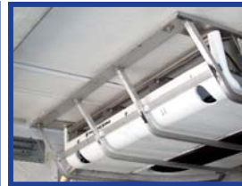
Ceiling-mounted Dual Rear Evaporators