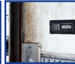
Convenient Rear Temp Remote Control