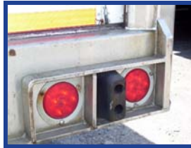
Stainless Steel Frame